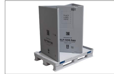
3. The folded sleeve needs to be lifted and erected.