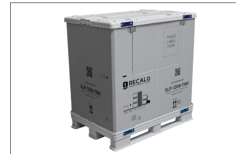
9. Built-up closed SLP.