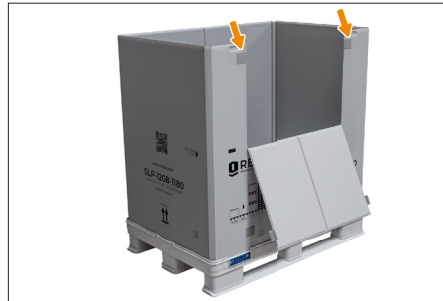
5. For better loading of the SLP the flap door can be opened if needed. Therefore, you push the flap door outwards until the velcro fasteners release.