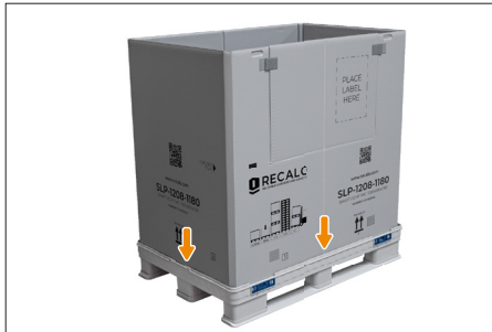
4. Afterwards you unfold the sleeve completely and push it into the groove of the base. There is no manual handling of the locks required.