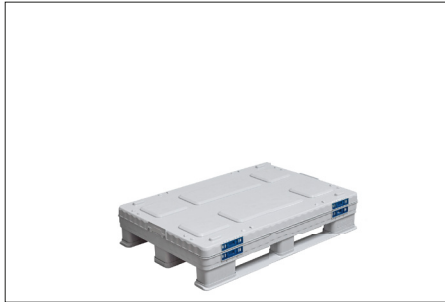
1. Folded SLP.