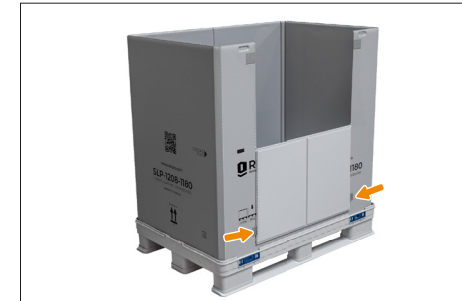
6. For better handling you can attach the opened flap door to the velcro pads outside of the sleeve. It will fit close to the sleeve.