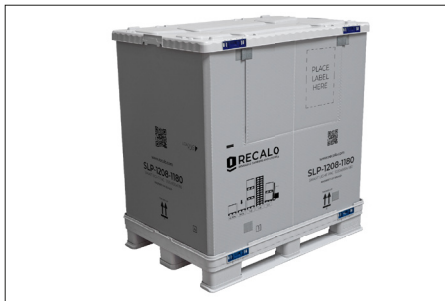
7. After the filling process the flap door is closed and the lid is placed.