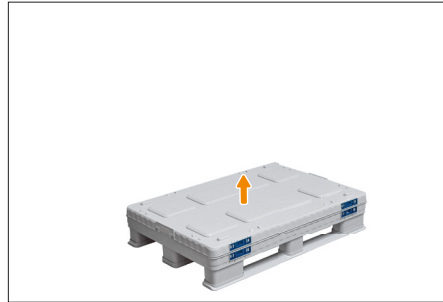
2. First remove the lid.