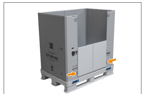
6. For better handling you can attach the opened flap door to the velcro pads outside of the sleeve. It will fit close to the sleeve.