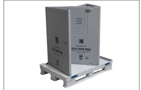
3. The folded sleeve needs to be lifted and erected.