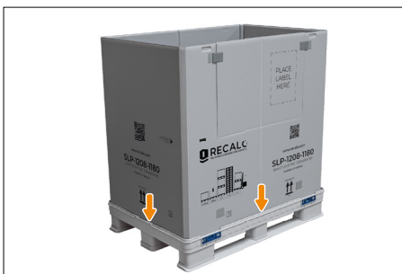
4. Afterwards you unfold the sleeve completely and push it into the groove of the base. There is no manual handling of the locks required.