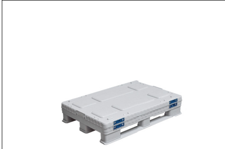
1. Folded SLP.