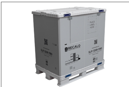
7. After the filling process the flap door is closed and the lid is placed.