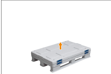
2. First remove the lid.