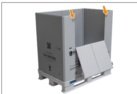
5. For better loading of the SLP the flap door can be opened if needed. Therefore, you push the flap door outwards until the velcro fasteners release.