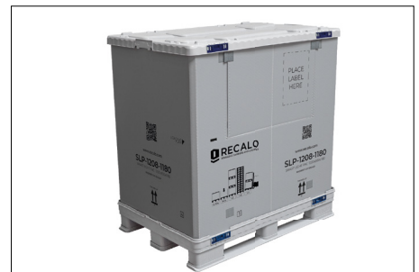
9. Built-up closed SLP.