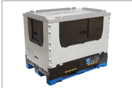
1. Assembled SHP.