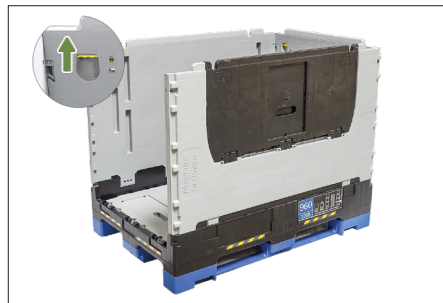
5. Unlock the first short sidewall from the long sidewalls and fold it down. The unlocking mechanisms are located inside of the box on the short sidewall.