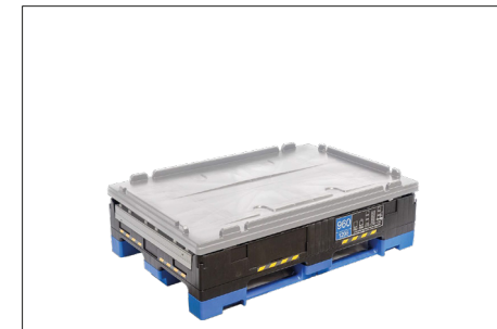
9. Place the lid.