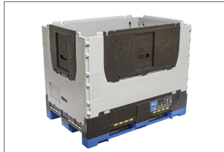
2. Remove lid.