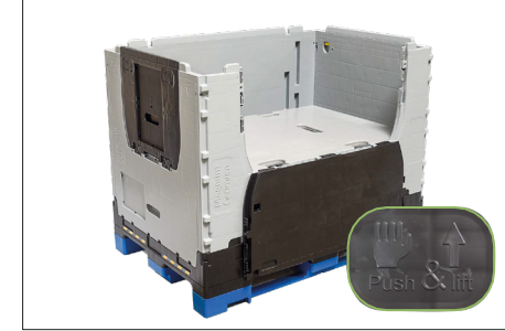
3. If one or more divider shelves in the box are inserted, take them out. In addition open the flap door in front by pushing the flap door inwards and then pulling it upwards.