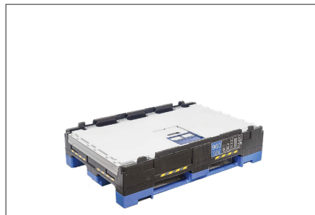
8. Fold down the second long sidewall.