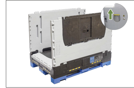
6. Unlock the second short sidewall from the long sidewalls and fold it down. The unlocking mechanisms are located inside of the box on the short sidewall.