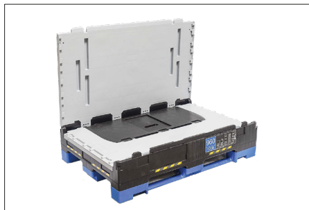
7. Fold down the first long sidewall.