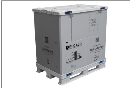
1. Assembled SLP.