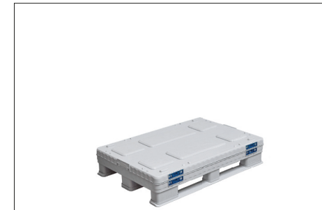
6. Finally, the lid is placed.