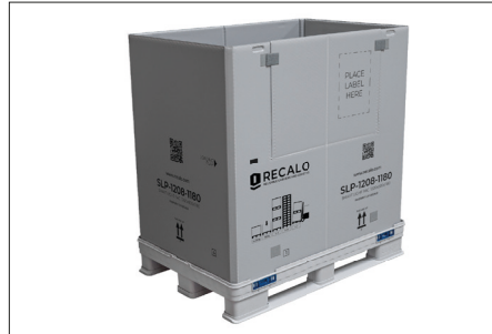
2. First remove the lid. In addition pull the lid upwards. There is no manual handling of the locks required.