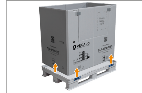
3. Now just pull the sleeve upwards.