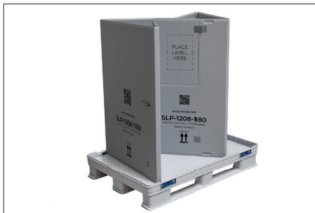
4. Fold down the sleeve.