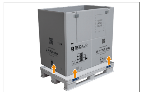
3. Now just pull the sleeve upwards.