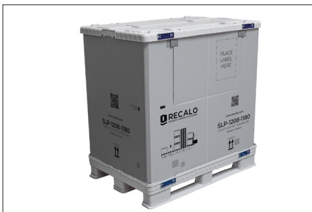
1. Assembled SLP.