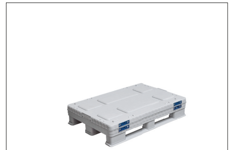
6. Finally, the lid is placed.