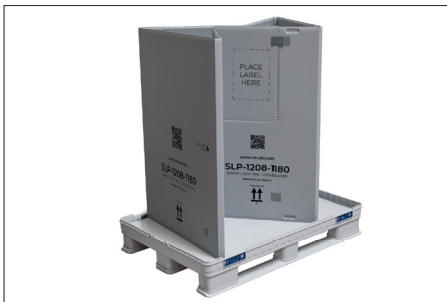
4. Fold down the sleeve.