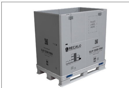
2. First remove the lid. In addition pull the lid upwards. There is no manual handling of the locks required.